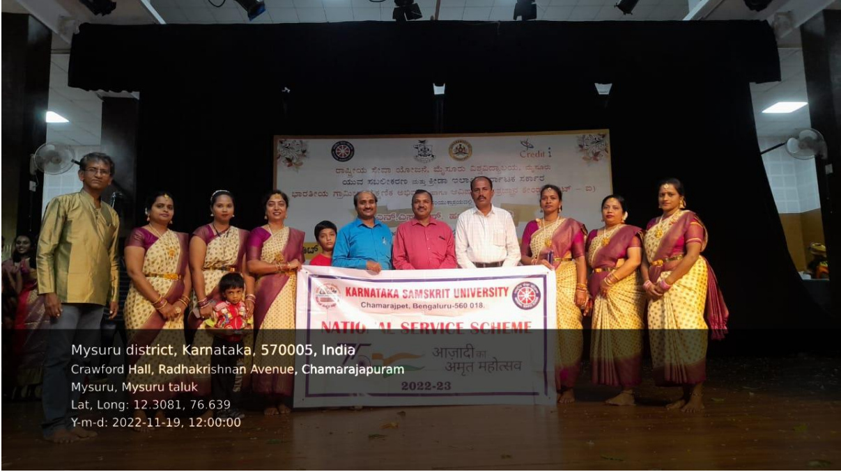
Mysuru district, Karnataka, 570005, India Crawford Hall, Radhakrishnan Avenue, Chamarajapuram Mysuru, Mysuru taluk Lat, Long: 12.3081, 76.639 Y-m-d: 2022-11-19, 12:00:00