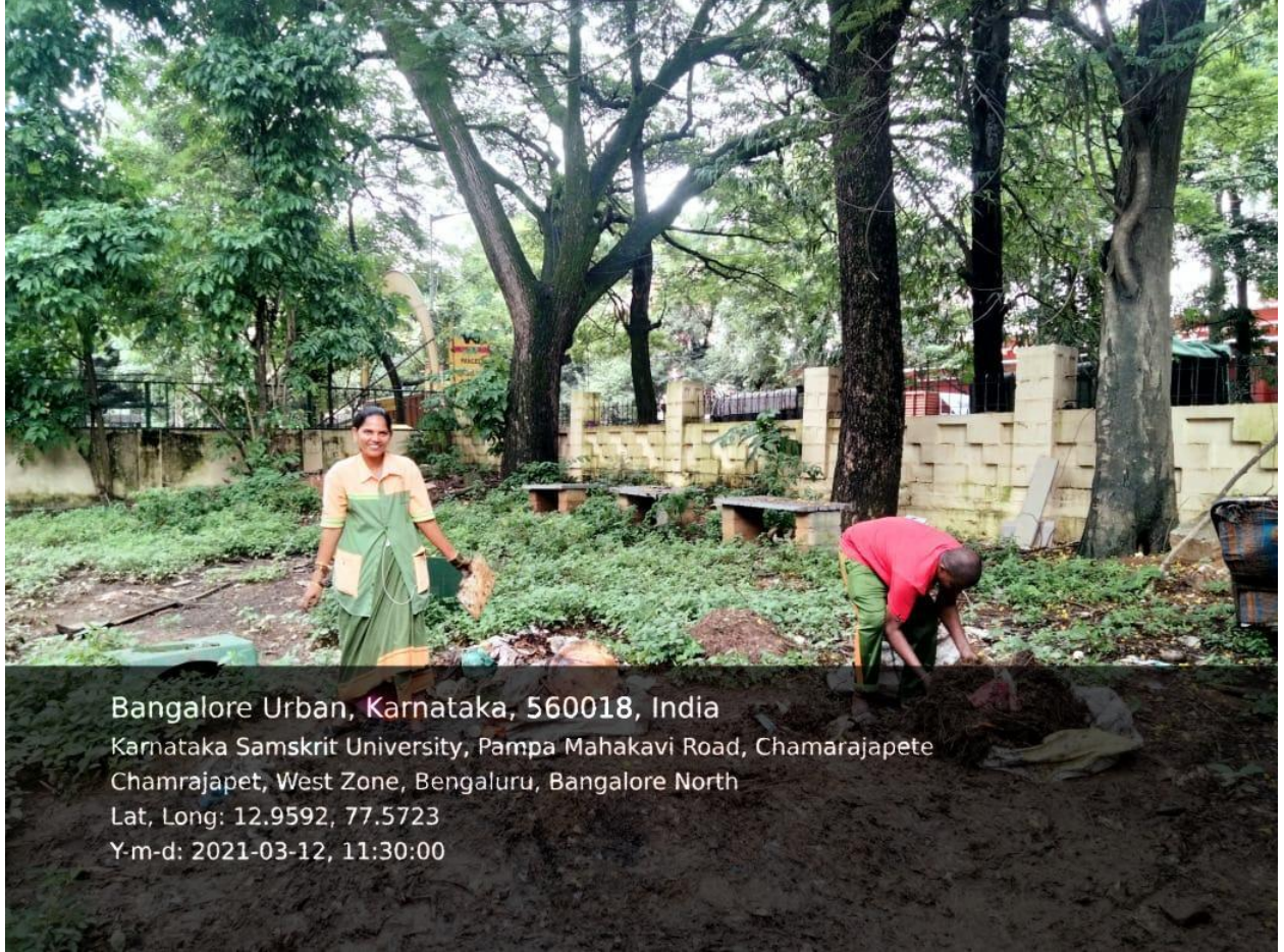
Bangalore Urban, Karnataka, 560018, India Karnataka Samskrit University, Pampa Mahakavi Road, Chamarajapete Chamrajapet, West Zone, Bengaluru, Bangalore North Lat, Long: 12.9592, 77.5723 Y-m-d: 2021-03-12, 11:30:00