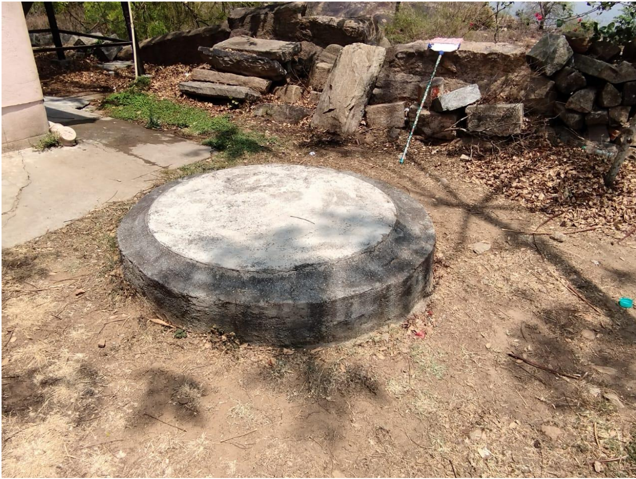
Melkote Compositing Pit